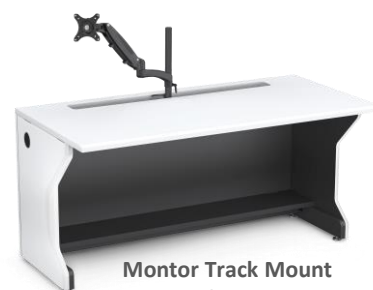
Monitor Track Mount Workstation